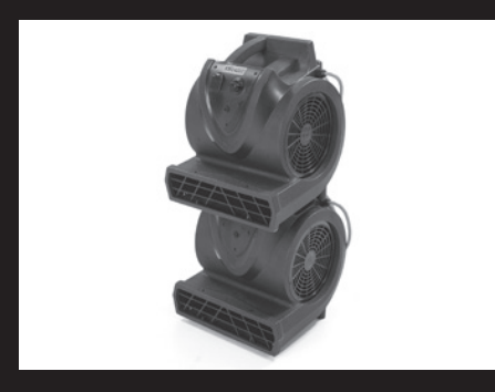
Designed to be compact, lightweight, and stackable.