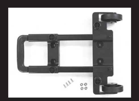
Optional trolley kit with wheels and retractable handle make it easy to transport.